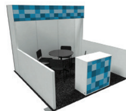
10'x10' Shell Scheme